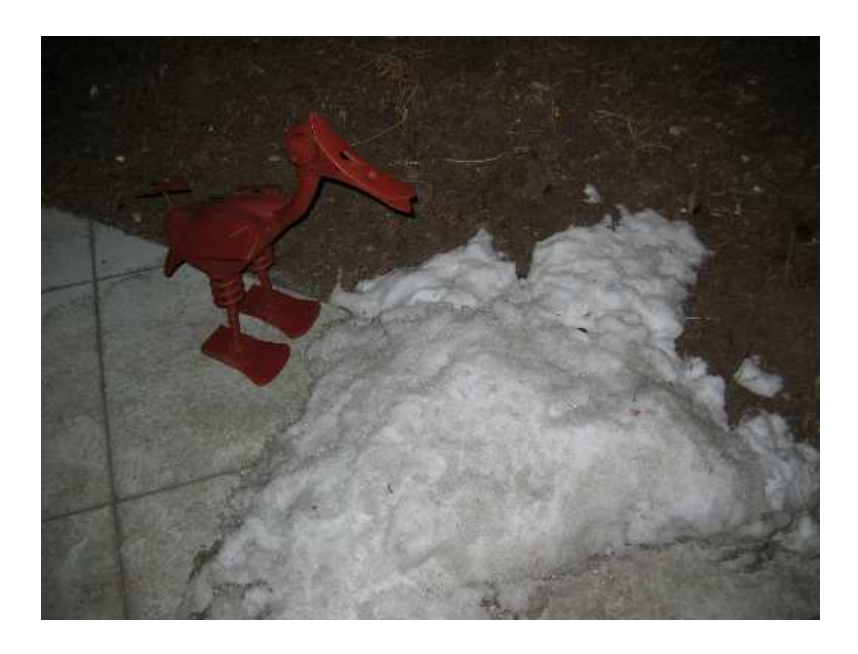
Figure 1: The great northern shoveler makes its home in California. However, on rare occasions, the mathematician duck has been observed getting lost on migratory travels. This specimen is clearly confused by the sight of snow.