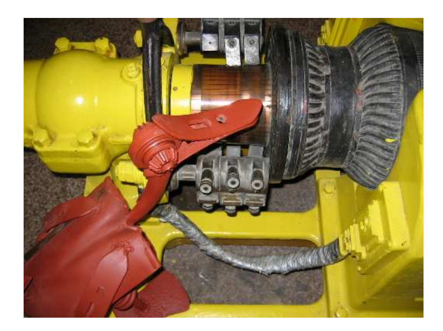
Figure 2: The mathematician duck has no natural fear of electrical machinery. This duck spent hours poking at this generator.