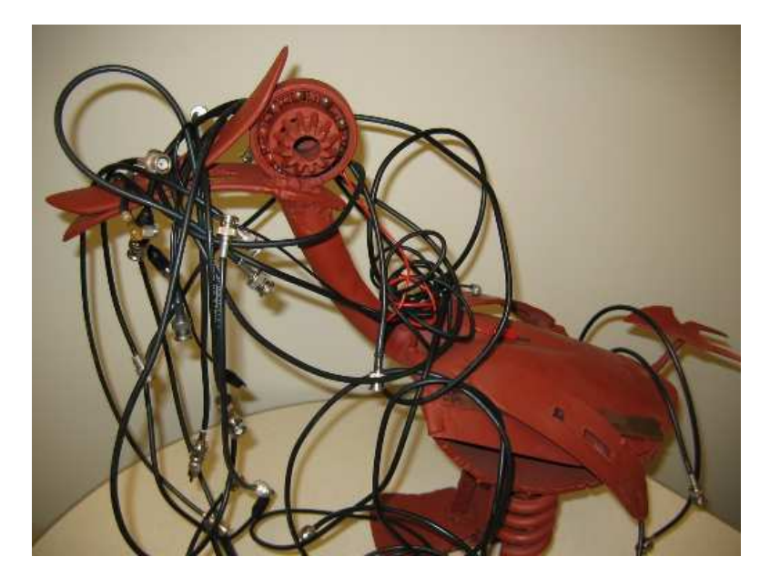
Figure 4: ... but often gets tangled in wires and cables.