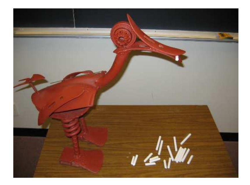
Figure 6: The mathematician duck consumes great quantities of chalk. Students often find the duck's behavior confusing and frightening.

Figure 5: Left alone in a classroom, the mathematician duck is known to drone on and on and on and on \ldots