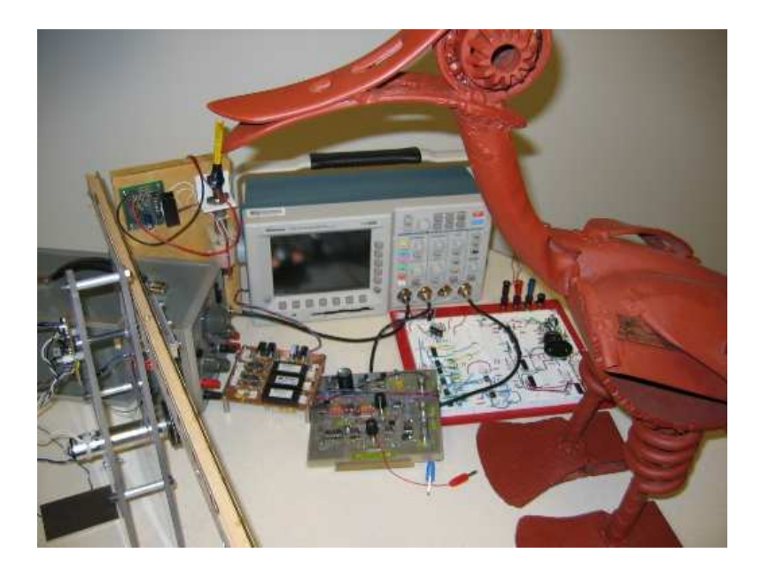
Figure 3: The mathematician duck is comfortable in the electrical engineering laboratory and is proficient with an oscilloscope ...