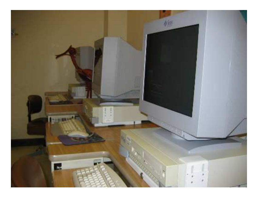
Figure 7: The plumage of the mathematician duck is a natural camouflage among computers. This duck has a sore neck from long work days of pecking at the keyboard.