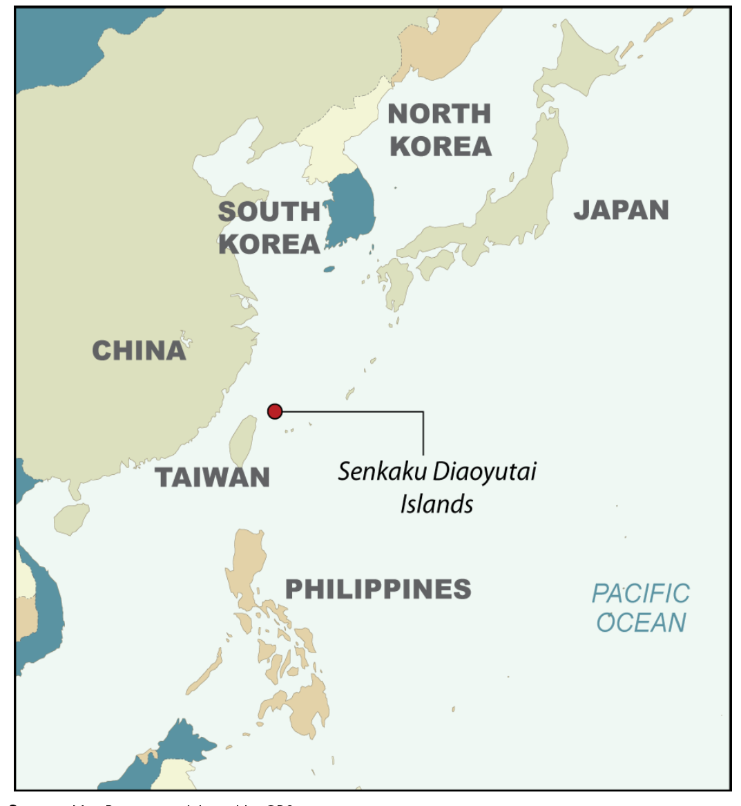
Figure 4: Map of Japan and China

9/17/08 —Japanese Defense Minister Yoshimasa Hayashi and Chinese air force chief Gen. Xu Qiliang agree that there is a need to enhance bilateral defense exchanges. Xu is the first commander of the People's Liberation Army Air Force to visit Japan since 2001.