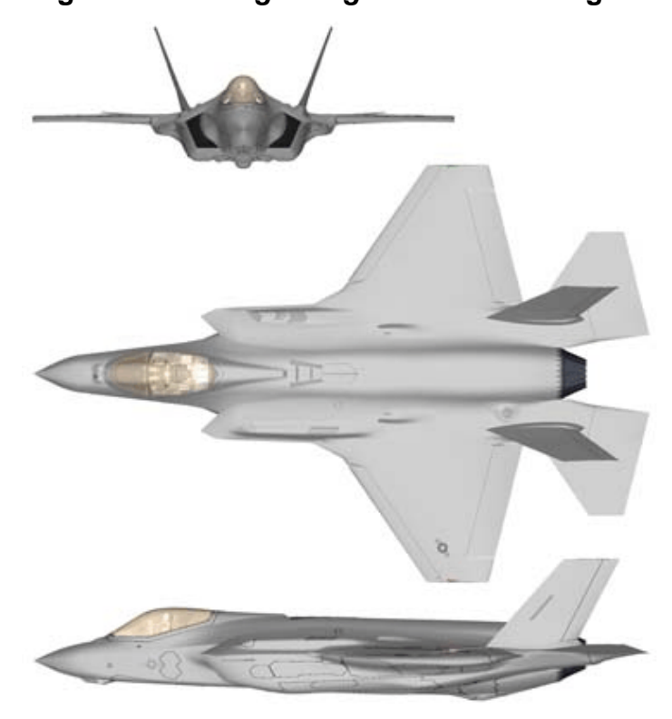
Figure 1. F-35 Lightning II Joint Strike Fighter

An additional 738 aircraft are expected to be ordered by the JSF development partner nations of the UK, Australia, Italy, Canada, Denmark, Turkey, the Netherlands, and Norway.<sup>6</sup> The United Kingdom is anticipated to be the largest foreign purchaser of the F-35, with a projected 138 STOVL aircraft.