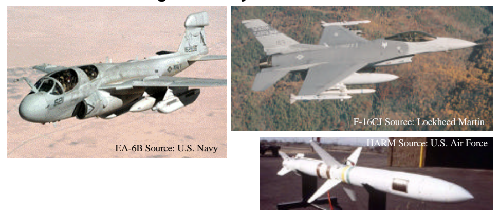
Figure 2. Key SEAD Assets

This experience suggests to many observers that rapid target detection, identification, and geo location will be important to the success of future SEAD missions.