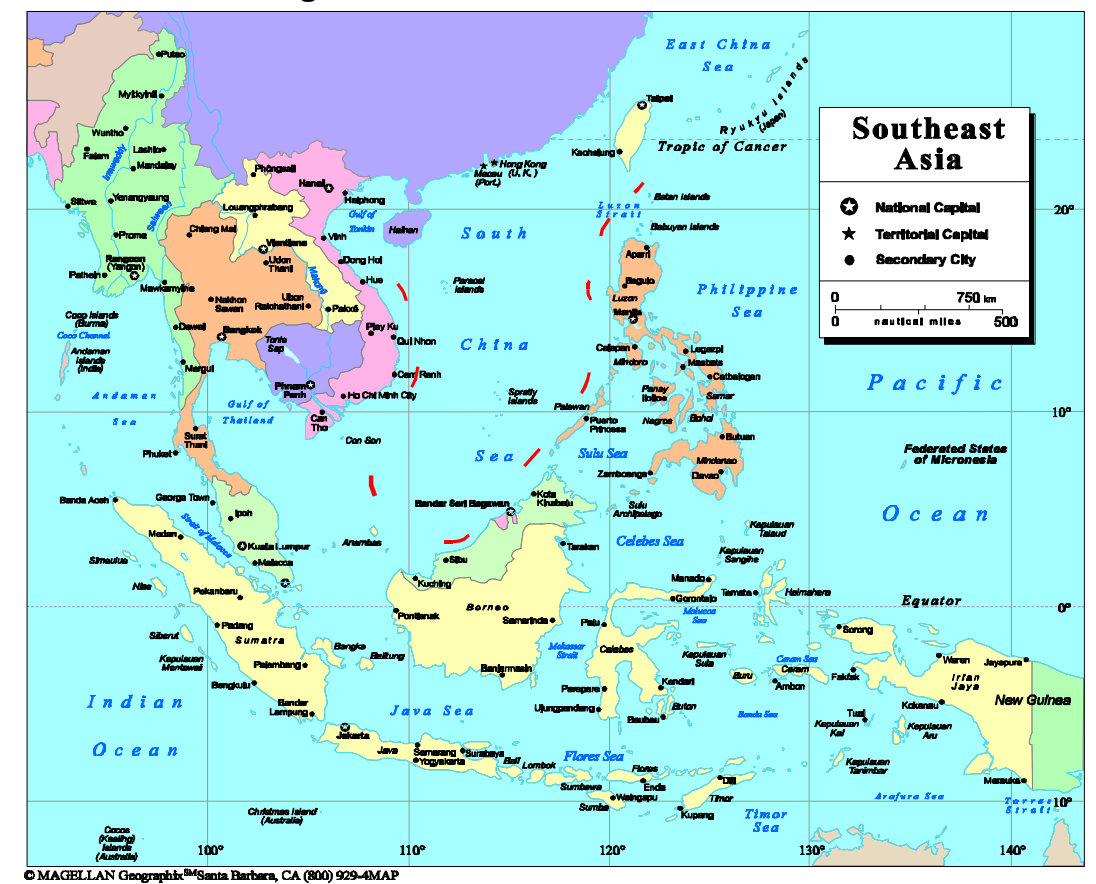
Figure 1. China's "Nine-Dotted Line"

subsume waters in its "historic bay" which otherwise would be subject to the 200 nautical mile EEZ limitations. Thus, any exploration or other economic activity can be conducted in an "historic bay" only with the express permission of the sovereign government. Other Chinese scholars, however, allege that western concepts that China "wants to make the South China Sea a domestic lake" are misconceptions.<sup>4</sup>