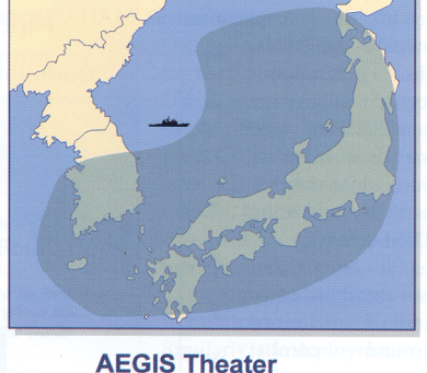
Defense Against Medium / Long Range TBMs

Maximizes TBMD and Cruise Missile Defense Role Most Effective Port, Airfield, Critical Asset Defense