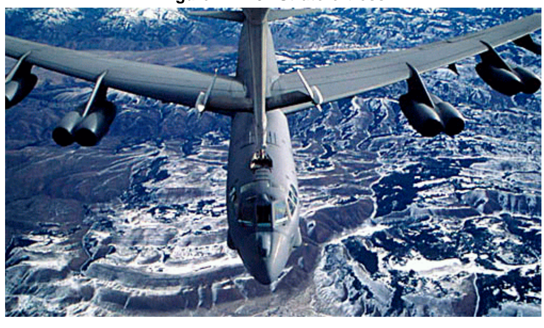
Figure 2. B-52 Stratofortress

The 40-year-old B-52 has remained relevant to a changing battlefield. Although nuclear strikes were its primary mission during the Cold War, the B-52 has carried out important non-nuclear missions in conflicts going back to the Vietnam War. Air Force Secretary James Roche stated recently that the B-52 has transformed three times in its history, from a high-level bomber to a low-level intruder to a stand-off cruise missile carrier to a close air-support aircraft. The B-52 is the only platform that can operate with more than 20 types of bombs and cruise missiles in the U. S. inventory. In high-threat areas where enemy defenses are robust, B-52s employ airlaunched cruise missiles (20 per aircraft) to attack ground targets from a distance. In low-threat environments such as Afghanistan or Iraq, B-52s can use JDAM precision bombs or various gravity bombs.