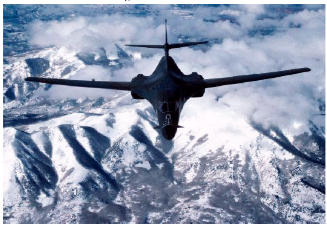
Figure 3. B-1B Lancer

Like all the long-range bombers currently serving in the Air Force, the B-1B was designed to carry nuclear weapons deep into Soviet territory during the Cold War. The plane's supersonic speed, reduced radar signature, and large payload gave it important advantages over the B-52, even though its range was shorter. Since the end of the Cold War, the Air Force has adapted the B-1B to carry conventional weapons, although its value in conventional warfare has only been tested in the recent conflicts in Afghanistan (2001) and Iraq (2003). The B-1B has the largest payload capacity of the three bombers and can carry a broad array of precision and non-precision weapons. Ongoing upgrades will increase the variety of weapons it can carry and will enable it to deliver three different munitions to separate targets in a single sortie, a first among U.S. warplanes.