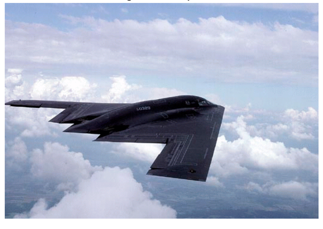
Figure 4. B-2 Spirit

The B-2 is slower and has a smaller payload than the other bombers, but its role is different because of its stealth. It is the only bomber capable of operating in well-defended airspace and is intended for early strikes in a conflict. The B-2, along with the F/A-22, is the centerpiece of the Air Force's "Global Strike Task Force" concept, which is designed to attack "anti-access" targets in future conflicts, opening the way for follow-on platforms like the Joint Strike Fighter and the other bombers. <sup>105</sup>