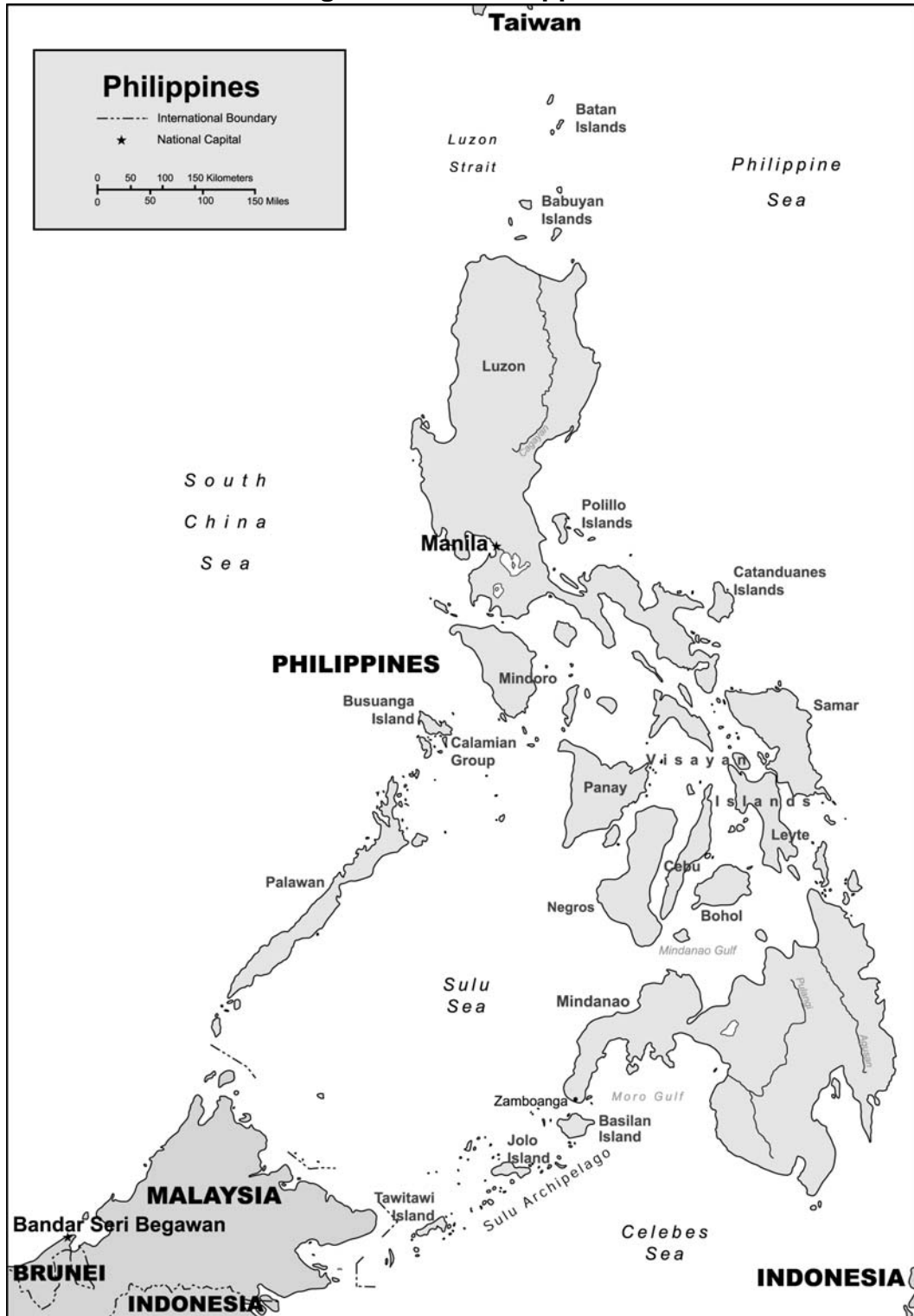
Figure 5. The Philippines

Source: Map Resources. Adapted by CRS. (K.Yancey 4/15/04)