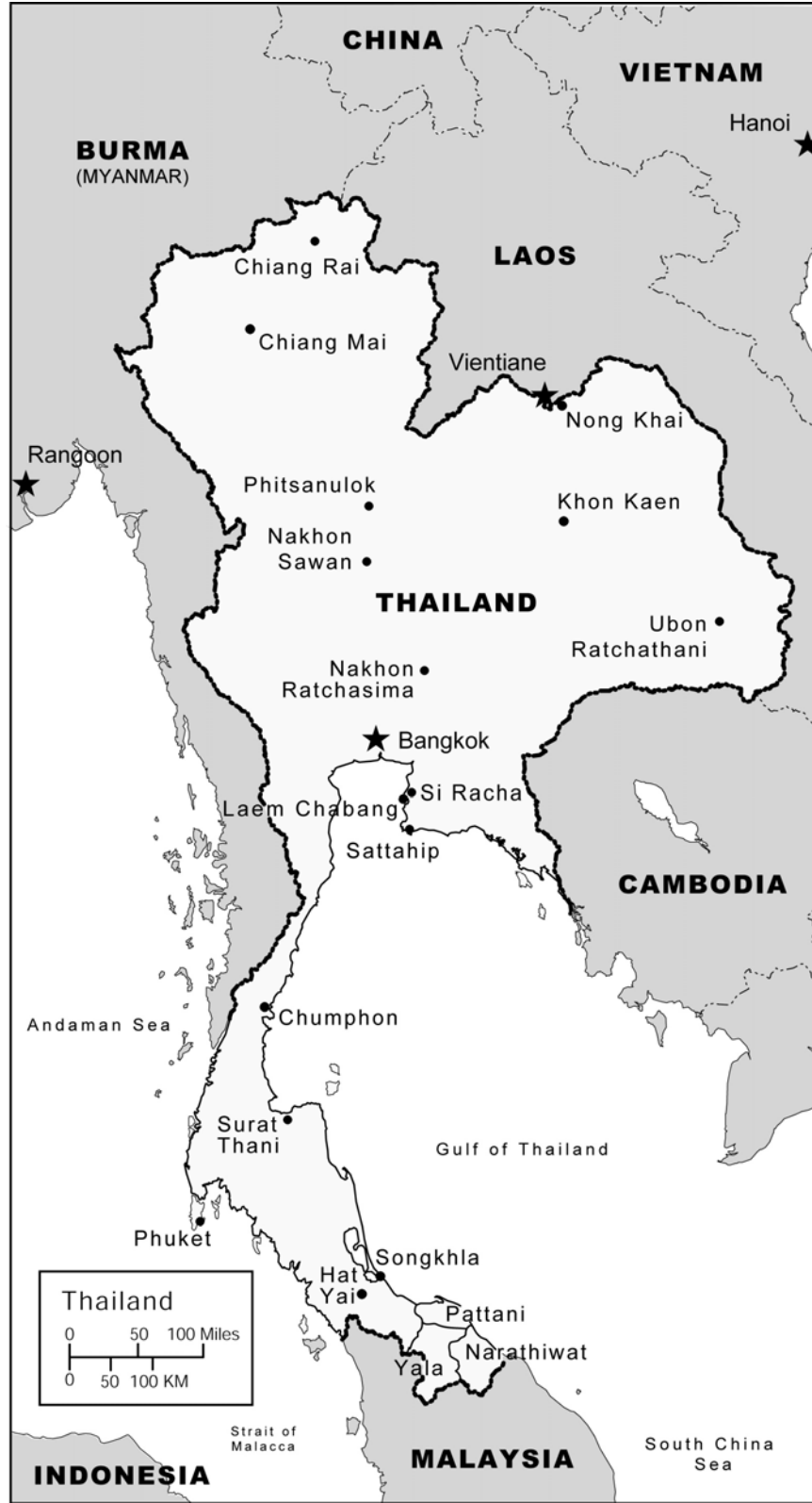
Figure 6. Thailand