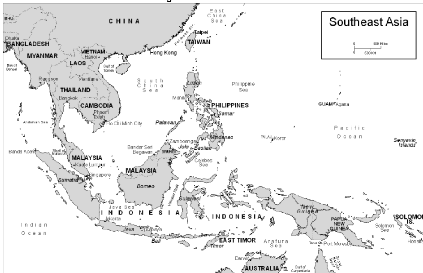
Figure 2. Southeast Asia