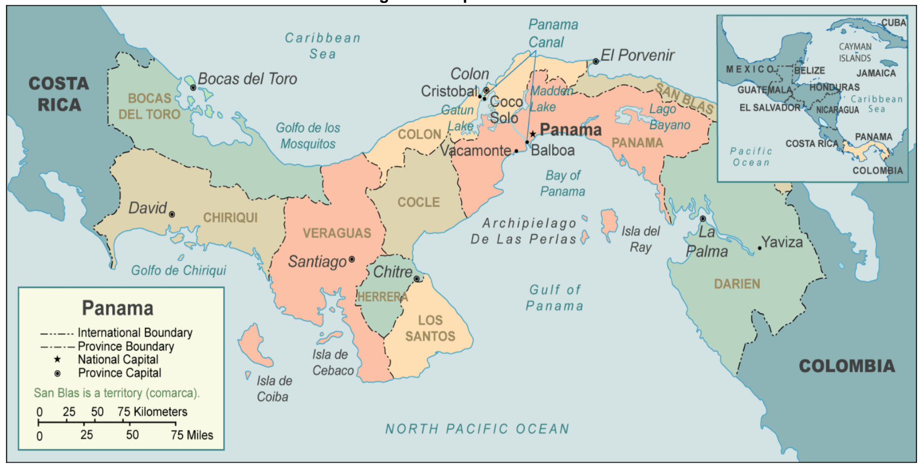
Figure 1. Map of Panama