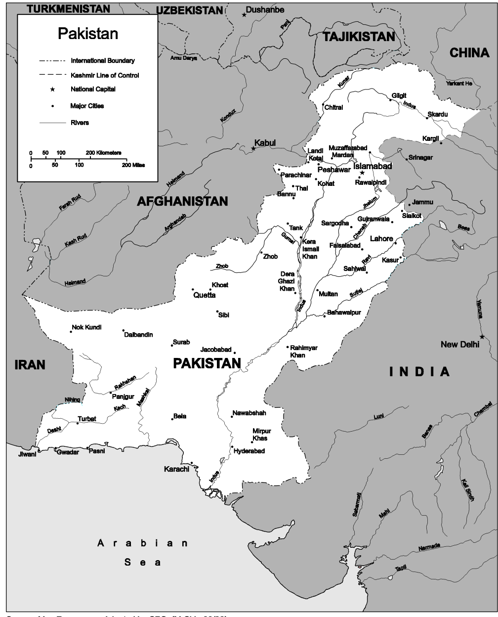
Figure 2. Map of Pakistan

Given Pakistan's strategic setting, large Muslim population, experience with religious extremism, weapons proliferation activities, and historical involvement in regional conflict, the level of stability and quality of governance there are likely to remain of keen interest to most U.S. policymakers.