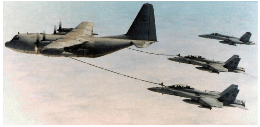
Figure 2. USMC KC-130 Refueling F/A-18s with Hose-and-Drogue

the hose-and-drogue system, can simultaneously employ two such mechanisms — and, refuel two aircraft simultaneously. The boom, however, can dispense fuel faster than a hose-and-drogue.