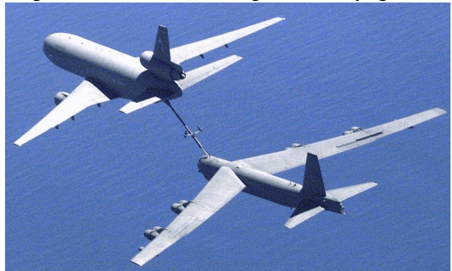
Figure 1. USAF KC-10 Refueling B-52 with Flying Boom

Currently, Air Force fixed-wing aircraft refuel with the "flying boom." The boom is a rigid, telescoping tube that an operator on the tanker aircraft extends and inserts into a receptacle on the aircraft being refueled. ( Figure 1 ).