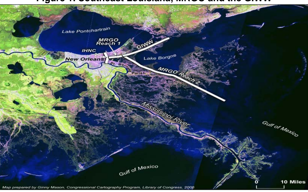
Figure 1. Southeast Louisiana, MRGO and the GIWW

Harbor Navigation Canal (IHNC, also known as the Industrial Canal), where part of the Port of New Orleans is located. While some portions of the Port of New Orleans are accessed via the MRGO, others are located directly on the Mississippi River. Therefore, the Mississippi River and the MRGO and the GIWW are connected by the IHNC and its lock, which is located at the southern end of the IHNC intersection where it intersects with the Mississippi River (see Figure 1 ).<sup>2</sup>