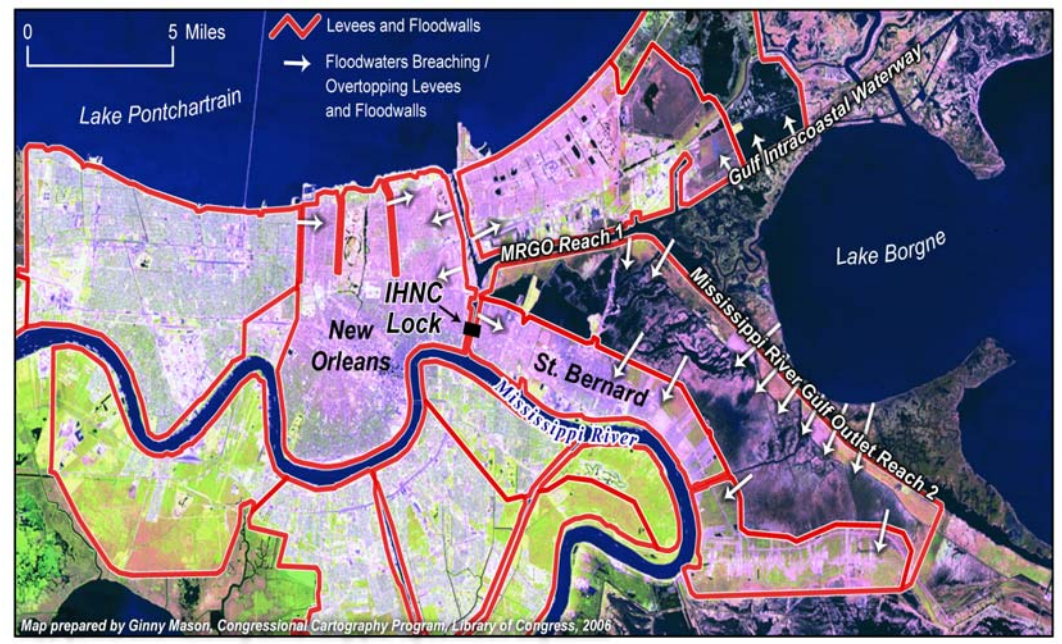
Figure 3. New Orleans Flooding During Hurricane Katrina

The Interagency Performance Evaluation Task Force (IPET) created by the Corps performed a post-Katrina analysis of New Orleans hurricane protection performance; it concluded on the basis of several computer models that Reach 2 did not transport a large amount of water from the Gulf toward the city's interior, and thus did not serve as a hurricane highway for storm surge from the Gulf during Hurricane Katrina. The IPET Report noted that Reach 2 did not convey a large amount of water toward the interior of New Orleans. This was the case for Hurricane Katrina because the storm's surge was sufficiently large to inundate the wetlands surrounding the MRGO, thus creating a flow area much larger than the channel itself; this made the channel's transport of water marginal compared to the quantity of water moving across the wetlands.<sup>13</sup> The IPET Report found, however, that the transport of Gulf waters along Reach 2 during weaker storms may be more significant.