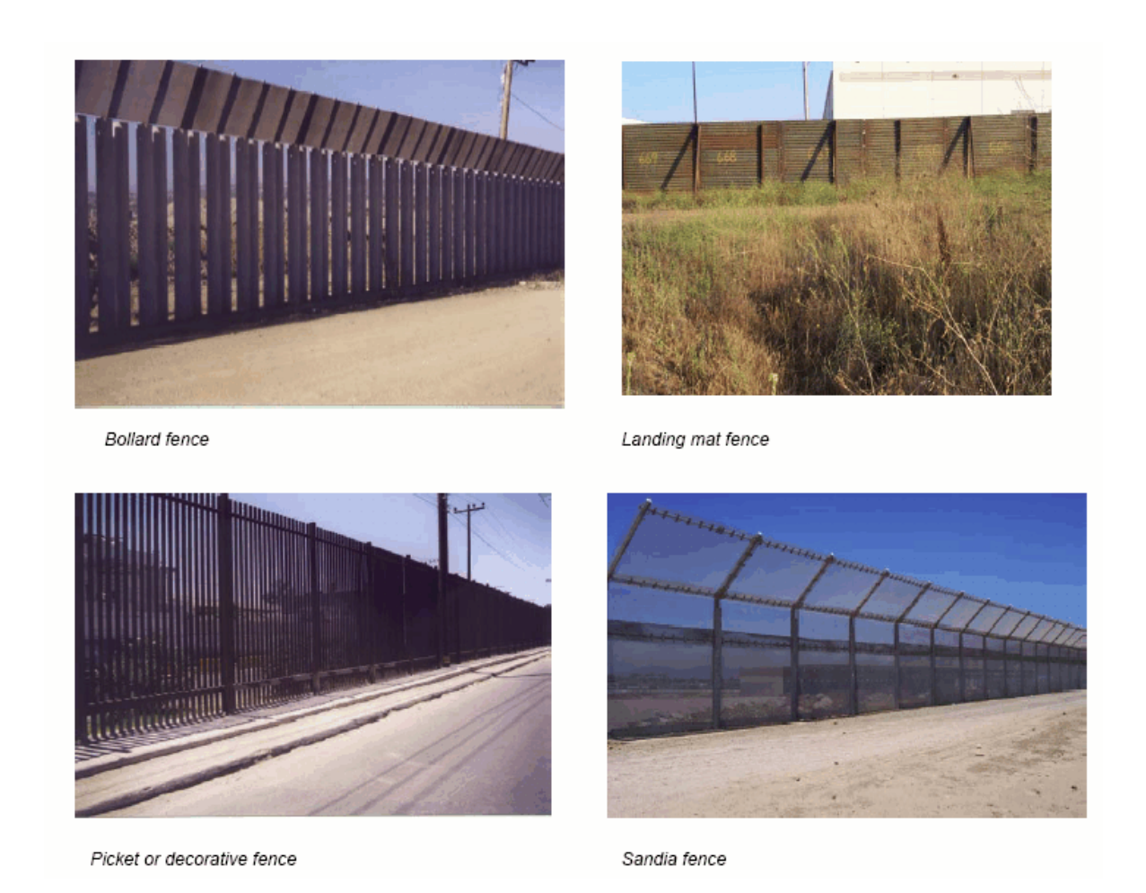
Source: U.S. Department of Justice, Immigration and Naturalization Service, Environmental Assessment for Infrastructure Within U.S. Border Patrol Naco-Douglas Corridor Cochise County, Arizona , August, 2000, p. 1-13.