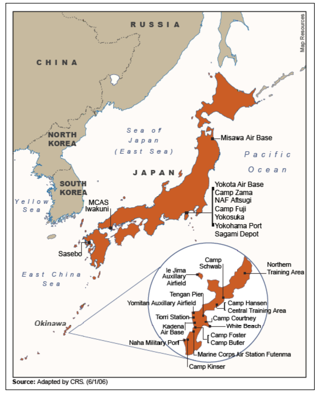
Figure 1. Map of U.S. Military Facilities in Japan

which had been problematic in the past. Alliance managers consider cooperation in the interagency process crucial to implementing further security cooperation.