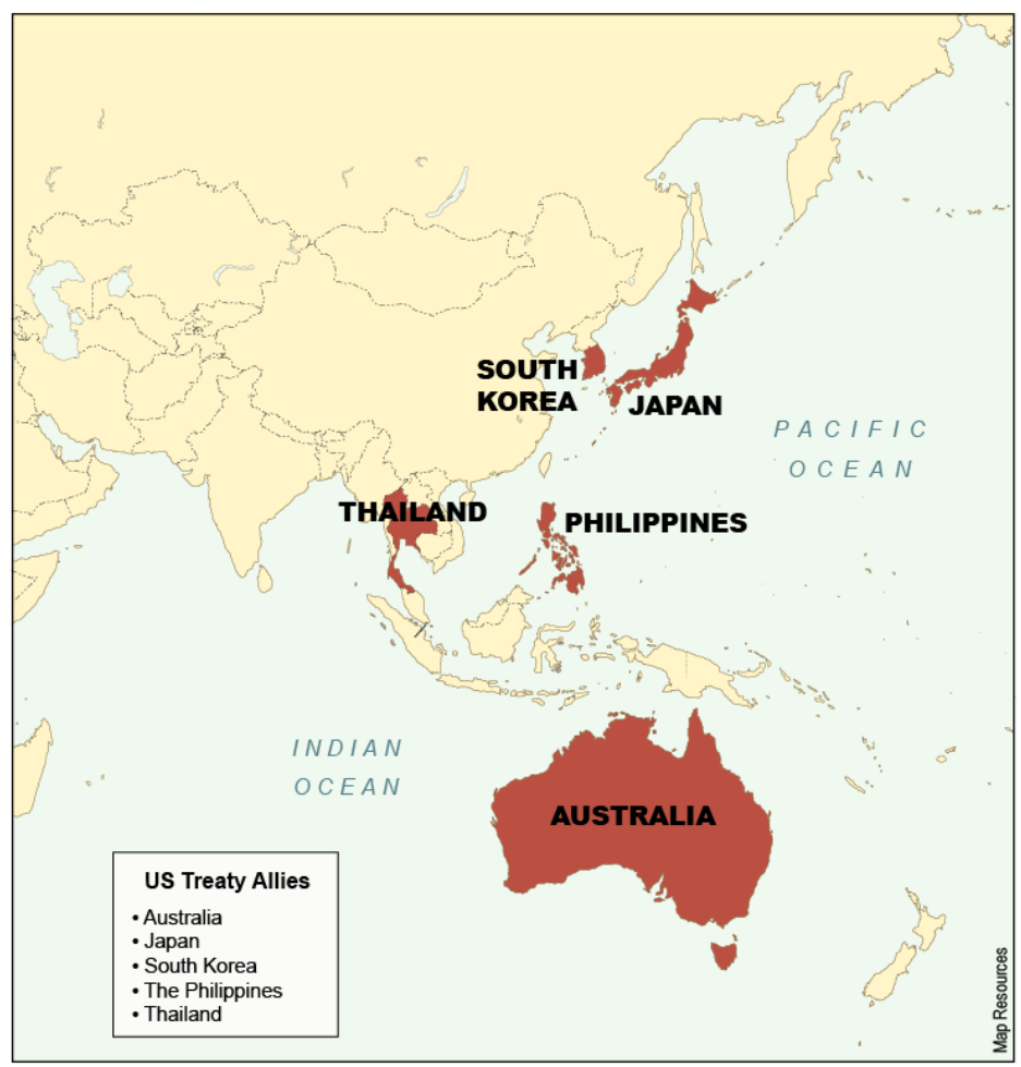
Figure 3. The United States Treaty Allies in Asia

Thailand is viewed as seeking to balance its American relationship with one with China; New Zealand was de facto dropped from the Australia-New Zealand-United States (ANZUS) alliance in the mid 1980s; poor relations with the Philippines led the United States to leave its military bases there in 1992 and there are signs of emerging differences in the U.S.-Republic of Korea relationship. Despite these developments, the system has endured because the correlates of power in post war Asia have not "altered in a way that suggests that the United States is not a useful balancer of last resort."<sup>53</sup> Figure 3 shows the locations of the United States' regional allies.