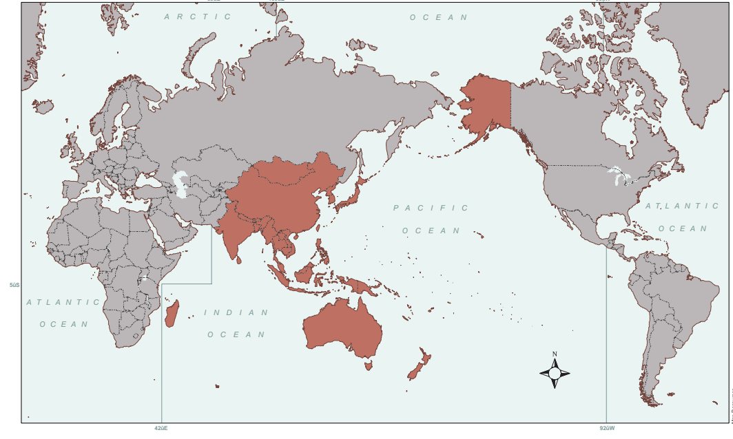
Figure 2. U.S. Pacific Command (USPACOM) Area of Responsibility

in the PACOM AoR, five are U.S. treaty allies.<sup>32</sup> Pacific Command's AoR spans an area from Alaska to Madagascar and from India to the South Pacific. The U.S. Pacific Command has service components as well as subordinate unified commands, including U.S. Forces Japan, U.S. Forces Korea, Special Operations Command Pacific, and the Alaskan Command. It also has Standing Joint Task Forces assigned to it. Operationally, the Pacific Commander reports directly to the Secretary of Defense and the President.<sup>33</sup> Figure 2 illustrates the USPACOM area of responsibility (AoR).