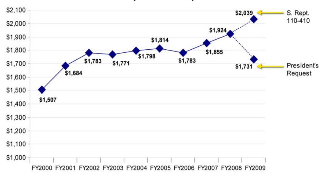
Figure 2. Funding for Older Americans Act Programs, FY2000-FY2008, and FY2009 Proposals ($ in millions)