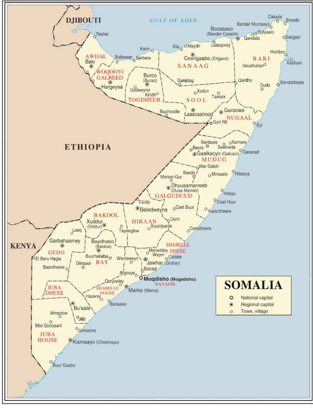
Figure 2. Map of Somalia