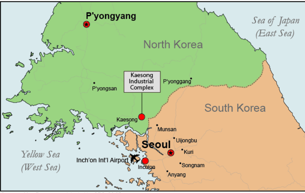
Figure 1. Location of the Kaesong Industrial Complex

The Kaesong Industrial Complex (KIC) is an industrial park located in the Democratic People's Republic of Korea (DPRK or North Korea) just across the demilitarized zone from South Korea. As of November 2007, over 50 medium-sized South Korean companies were using North Korean labor to manufacture products there, employing around 20,000 workers. The complex was planned, developed, and financed largely by South Korea, and it has become a symbol of the growing level of engagement between the North and the South.