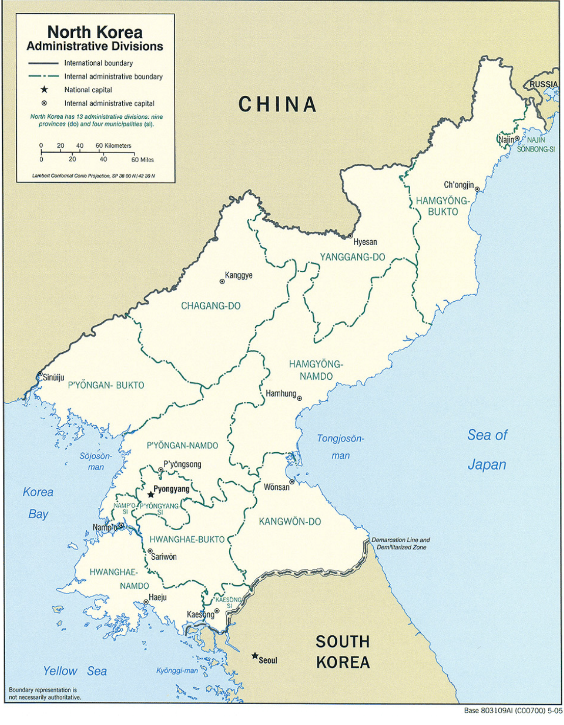
Figure B-2. North Korea: Administrative Divisions (as of 2005)