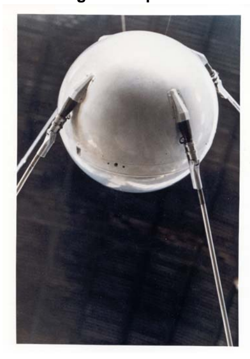
Figure 1. Sputnik

The USSR's ability to launch a satellite ahead of the United States led to a national concern that the United States was falling behind the USSR in its science and technology capabilities and thus might be vulnerable to a nuclear missile attack.<sup>4</sup> The resulting competition for scientific and technological superiority came to represent a competition between capitalism and communism.