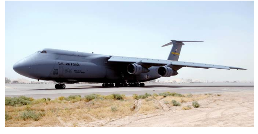
Figure 4. C-5 Galaxy at Balad Air Base, Iraq