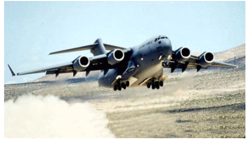
Figure 5. C-17 Globemaster III Taking Off from Unfinished Runway