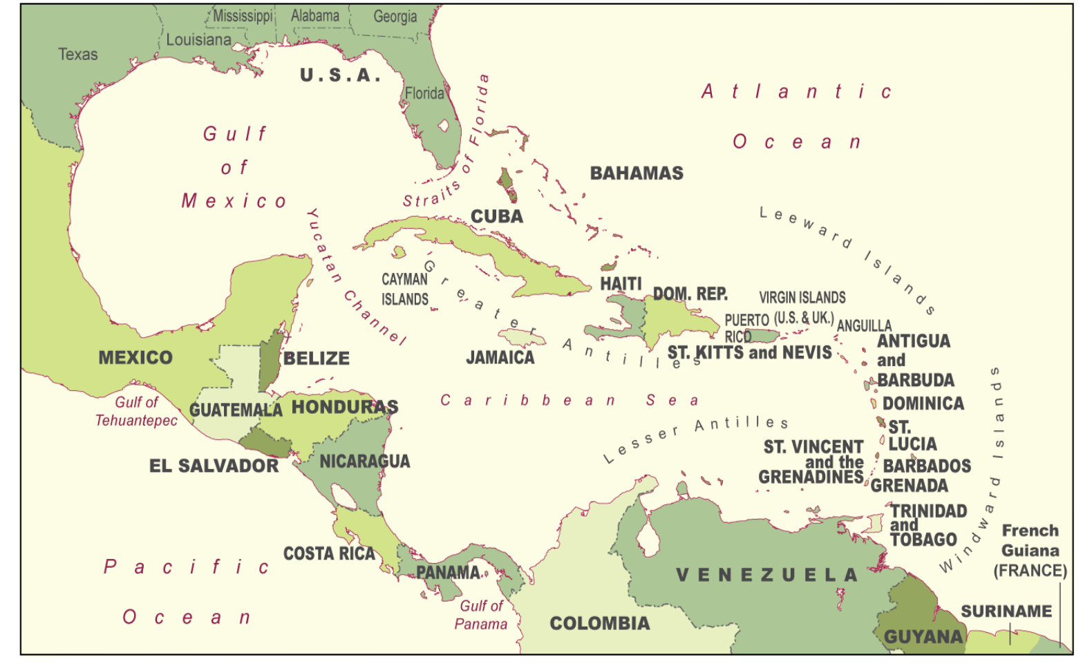
Figure I. Map of the Caribbean Region