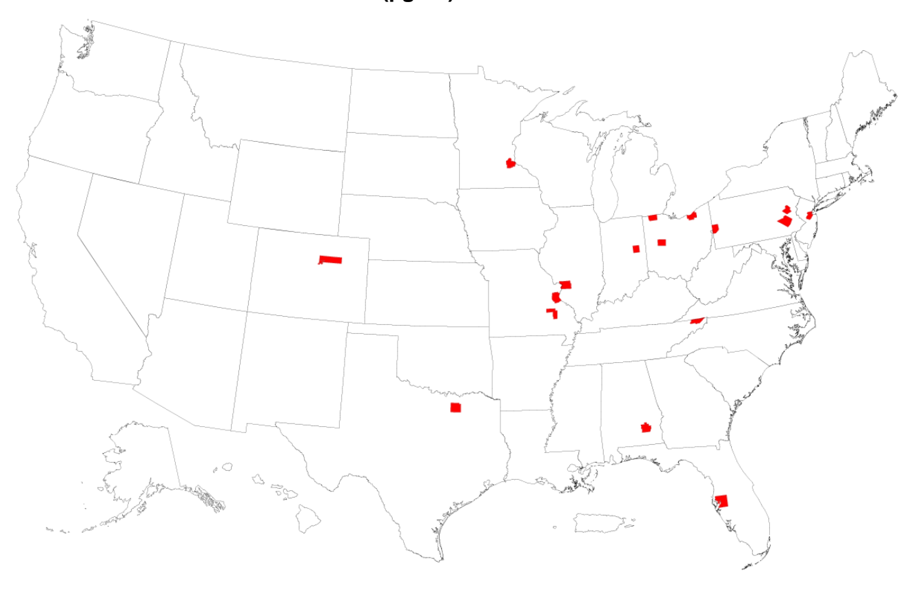
Figure 1. Counties with Monitors Violating the 2008 Lead Standard of 0.15 micrograms per cubic meter ( \mu g/m^3 )