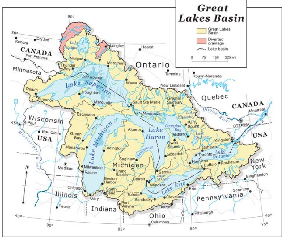
Figure 1. The Great Lakes Basin

and Canadian provinces are home to more than one-tenth of the population of the United States and one-quarter of the population of Canada. An estimated 40 million people rely on the Great Lakes Basin to provide jobs, drinking water, and recreation, among other things.<sup>8</sup>