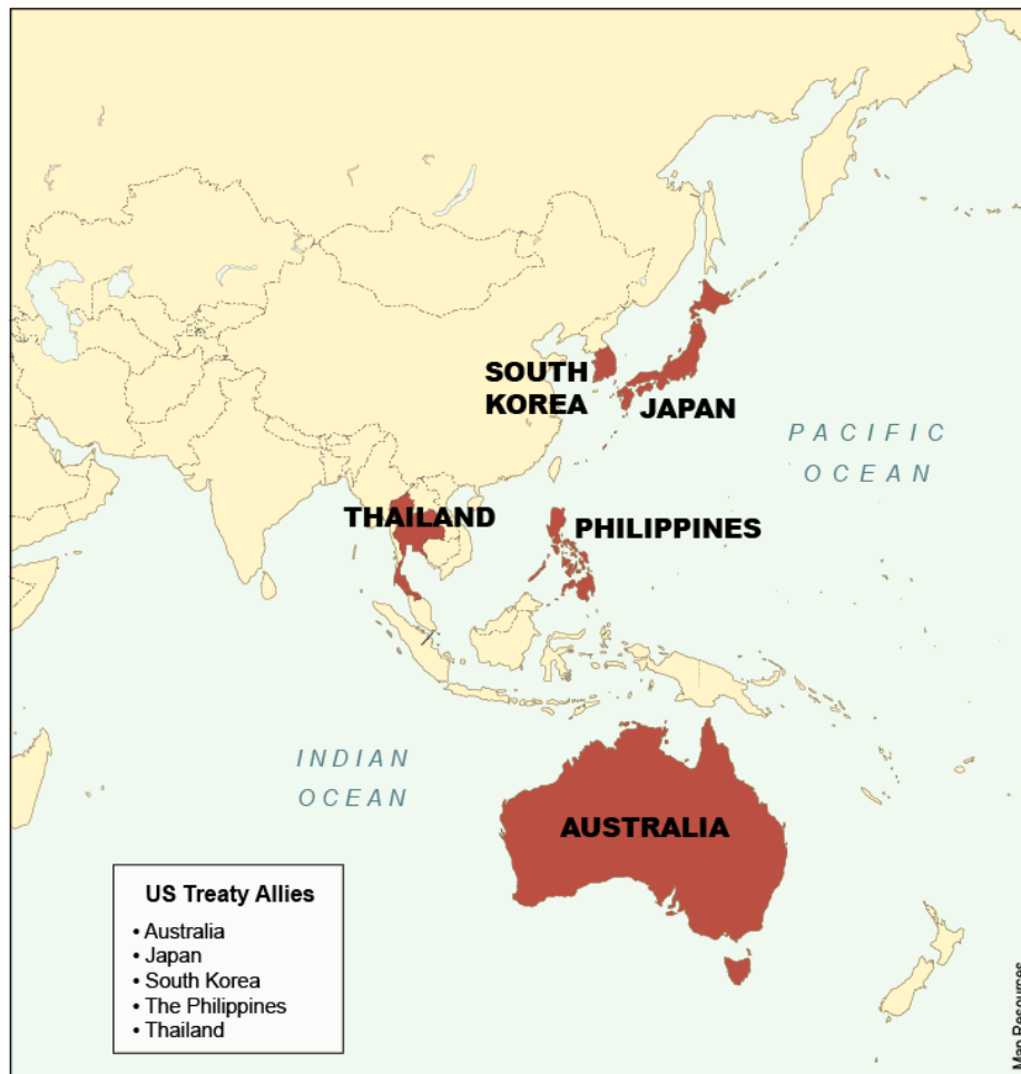
Figure 3. The United States Treaty Allies in Asia

Thailand is viewed as seeking to balance its American relationship with one with China; New Zealand was de facto dropped from the Australia-New Zealand-United States (ANZUS) alliance in the mid 1980s; poor relations with the Philippines led the United States to leave its military bases there in 1992 and there are signs of emerging differences in the U.S.-Republic of Korea relationship. Despite these developments, the system has endured because the correlates of power in post war Asia have not “altered in a way that suggests that the United States is not a useful balancer of last resort.” 53 Figure 3 shows the locations of the United States’ regional allies.