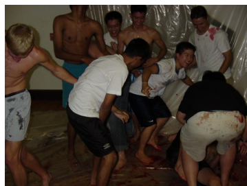
2002 Jello Drop... The sophomore class of 2005 is the only class with enough energy to participate!