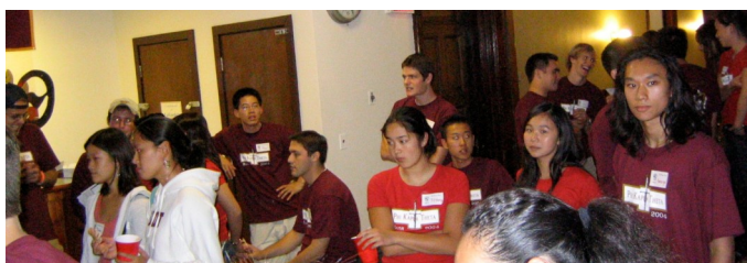
2004 Rush Event... How many Braveheart-themed rush shirts can you spot? How many Freshmen?