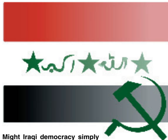
Might Iraqi democracy simply trade one dictatorship for another?

The tricky thing about a moderate theocracy is keeping it that way. If Shi'ites favor their own religion (by teaching it in schools, building their