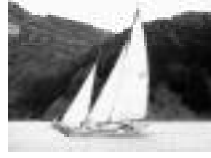
C.K.Dexter Haven's True Love sighted off Bermuda.