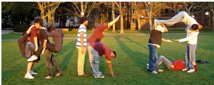
"Beyond awkward." What Phi Kappa Theta would look like if there was nothing to write on.

Island. We spent a few hours rock-climbing at a gym before going to Brown University. After scoping the campus for peck-worthy items, we stopped for the night at a motel. The next morning, we stopped at IHOP for breakfast and hung out at a nearby beach. Returning from the trip, all of us were tired, but the great memories we created were well worth it.