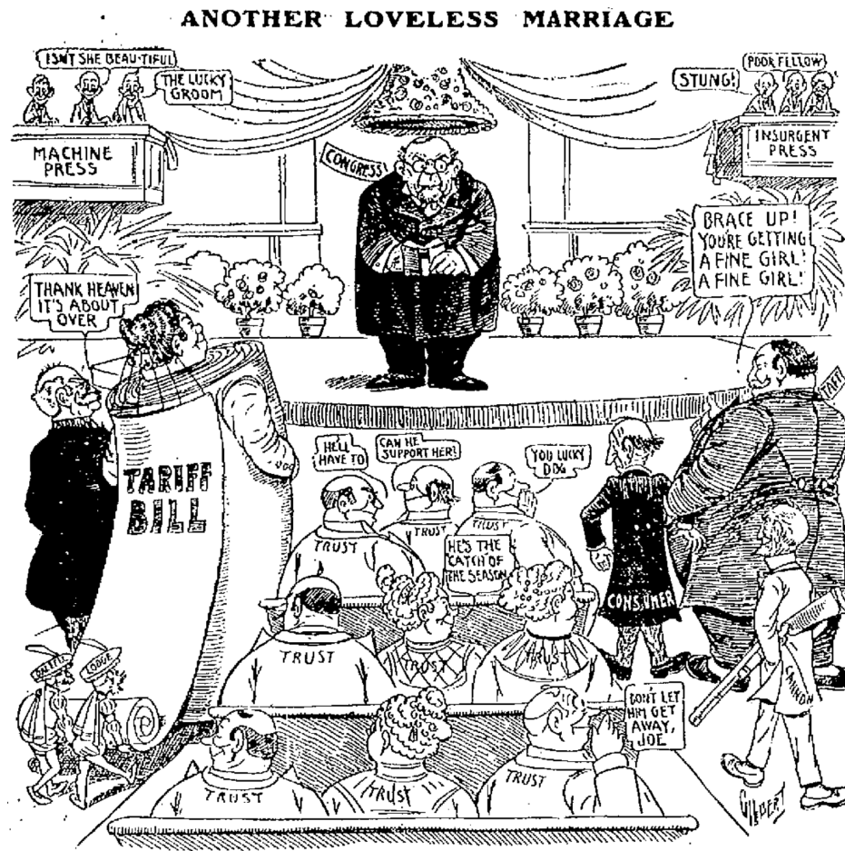
Figure 1: Cartoon depicting Taft and Taft's supporters dragging a hapless consumer to wed the ugly tariff bill, in the pocket of the trusts. 30