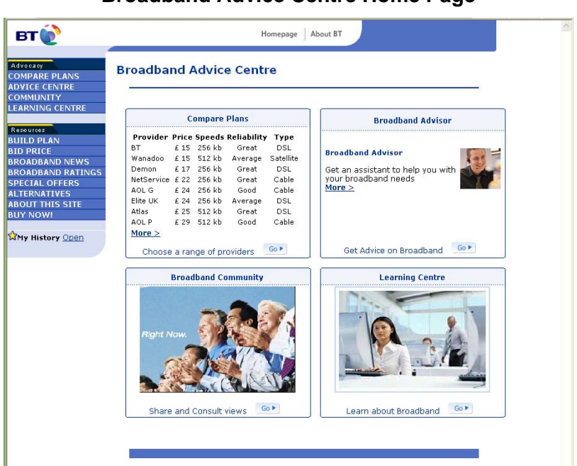
Figure 5 Broadband Advice Centre Home Page

Together, the four types of click-alternative variation give us ten (10) click-alternative characteristics: three basic dimensions, four functional characteristics, and three of four content areas.